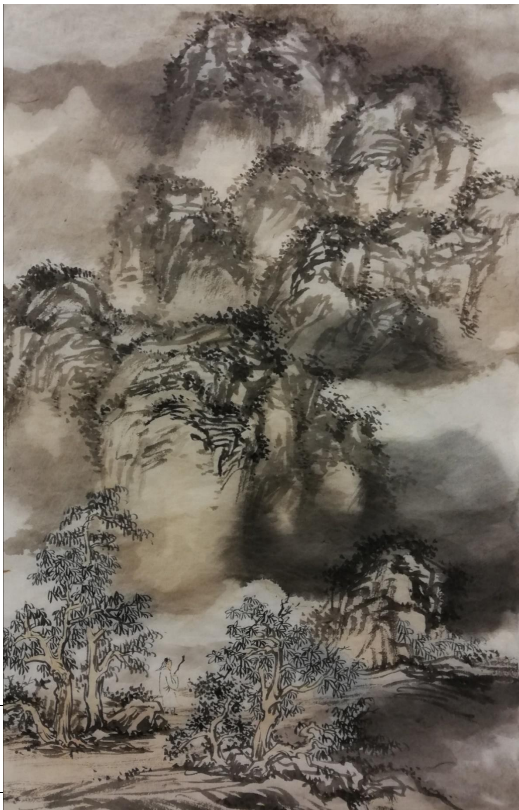
《九峰图》 15 x 35cm 2019 "Nine peaks" Xuan paper, ink, mineral and vegetables pigments