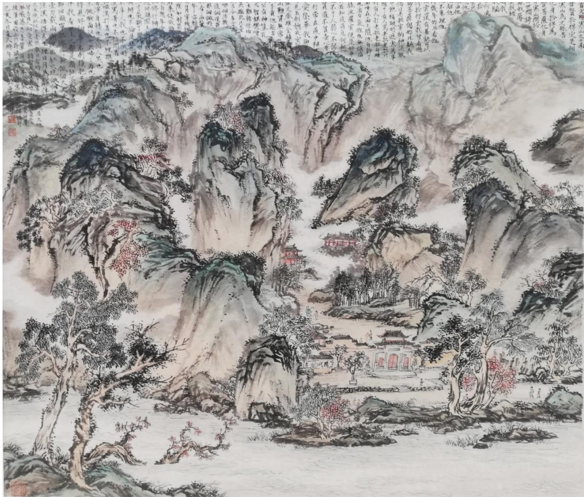
《Panorama of Tiantai Mingyan》 60 x 70cm 、 2019, Xuan paper, ink, mineral and vegetables pigments